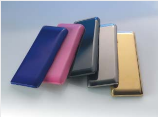
Battery cover in different colors

As a systems supplier of component assemblies incorporating plastics, OECHSLER provides further advantages. For our customers, we can also integrate injection-molded ceramics/metals in complex component groups by means of manual, semi- and fully automatic assembly processes. As required, we can also make the precision plastic parts necessary for this purpose through other specialized IM processes such as micro- or magnet injection molding, IMD, MID, multi-component technique, and in-mold assembly.