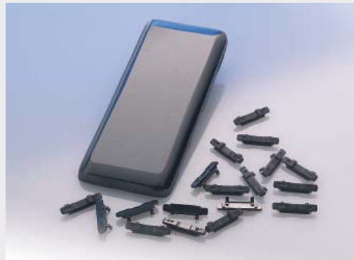
Battery cover with side keys