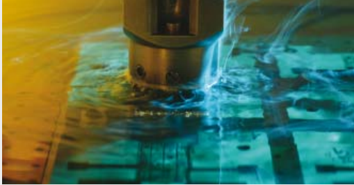
Computer-controlled ED machining for finest surface textures

The process FMEA (Failure Mode and Effects Analysis) at the beginning of the design stage serves to detect and prevent