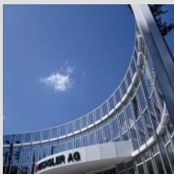
Our Ansbach Headquarter