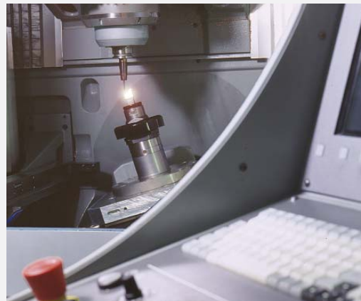
Fully automatic milling of complex electrodes

Our tool making know-how covers almost any special application