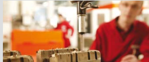
Taking tool measurements for quality control

Our tool making specialists will not only actively support you in the development of new high-performance tools, but they will also use the same degree of care when it comes to maintaining, repairing and optimizing existing OECHSLER-tools – faithful to deadlines and in certified quality.